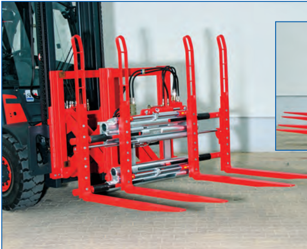
double fork positioner with load extender