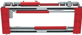
Type RZV-S, constant sideshift, no forks

The fork positioner range RZV feature bar guides and can be used also with long forks. The well balanced frame design offers durability and excellent visibility. The forks are moved on adapters and can open a little wider than the frame width. The adapter design allows the use of hook-on and/or bolt-on forks. The RZV range is available with constant or integral sideshift.