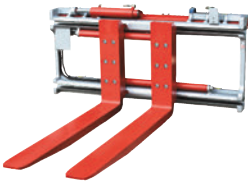
Type RZV-GS, constant sideshift, bolt-on forks